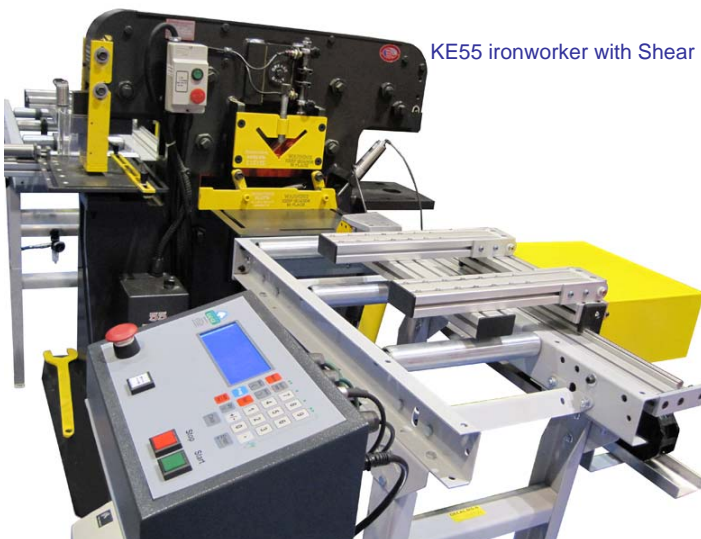
KE55 ironworker with Shear Feed