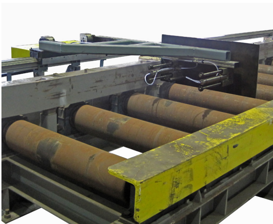
PD2000X with powered conveyor