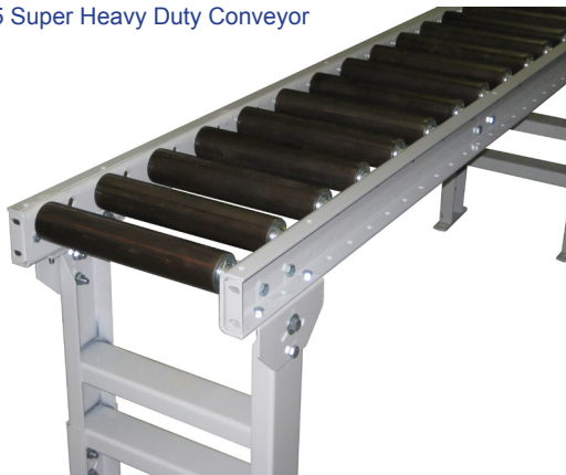
RD25 Super Heavy Duty Conveyor